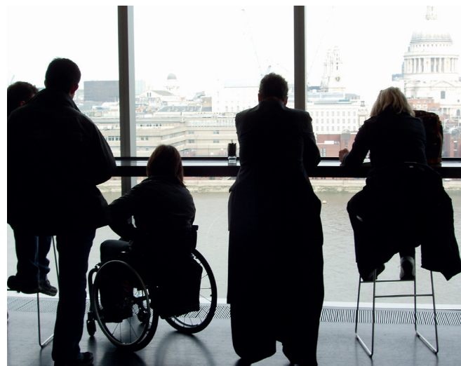
The café at Tate Modern

For example, it is important that universal design is incorporated as an element in the early stages of any project. Both in relation to the above understanding of the users, which requires knowledge of user needs, and in relation to knowledge involvement, including the involvement of resource persons and users.