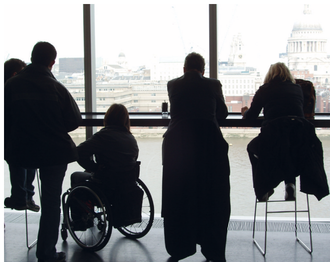
The café at Tate Modern

For example, it is important that universal design is incorporated as an element in the early stages of any project. Both in relation to the above understanding of the users, which requires knowledge of user needs, and in relation to knowledge involvement, including the involvement of resource persons and users.